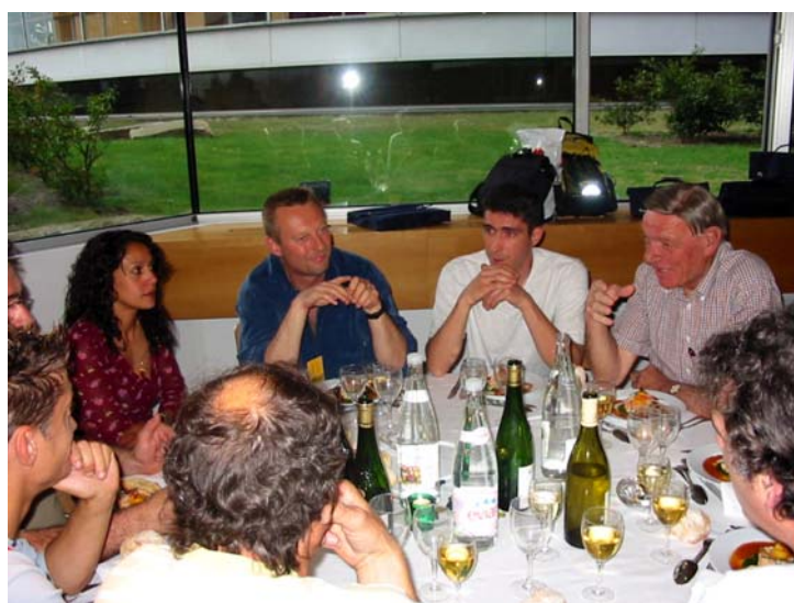
AU CONGRES DE LA FILPAC